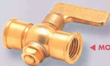
◀ MODEL A12

1/4" NPT female connections. In polished brass suitable for pressure to 200 psi hydraulic. Specify Type A12 .