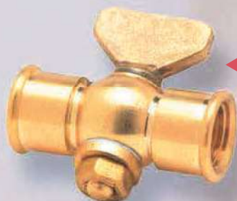
◀ MODEL A10

In polished brass (suitable for pressure to 125 PSI hydraulic) Specify Type A10 1/4" NPT female connections. A11 1/4" NPT male x female