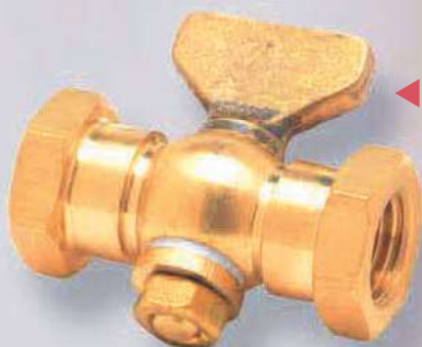
◀ MODEL A10E

In polished brass for pressures to 200 psi hydraulic, 1/4" NPT female connections with hex shoulders.