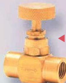
◀ MODEL BBV4

Brass, 1/4" NPT female connections only. Suitable for 600 psi at 300° F maximum; for water, oil or gas service.