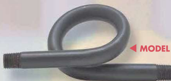
◀ MODEL AO31

Schedule 40 Steel (for max. 500 PSI and 400°F) Specify Type AO3I . 1/4" NPT. Brass (for max. 250 PSI and 400°F specify type AO3B ).